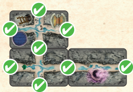
Examples of correct placement of spiderwebs

Note: If the spiderweb is blocking the open end of a path, you may still extend the path from there.