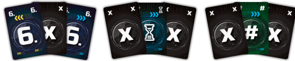
Examples of Wild Cards forming 3-of-a-kinds

You may not swap Wild Cards (since they don't have arrows on them).