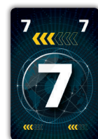
Your Teammate's Card

To swap to the left, play a card with yellow arrows and receive a card with blue arrows.